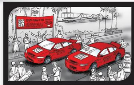
Making a buzz at the airport while whisking our winners away in luxury!