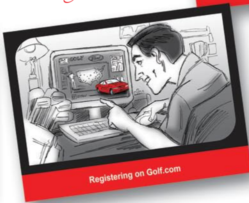
Registering on Golf.com